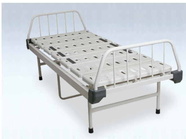
Photograph is PB-3102