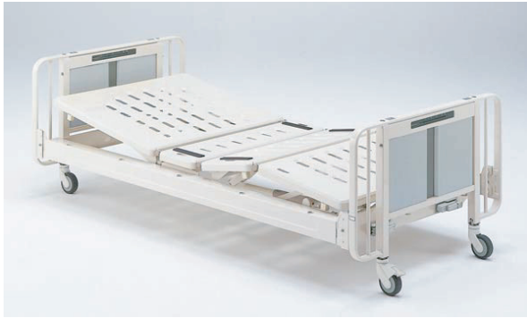
Photograph is KA-462A