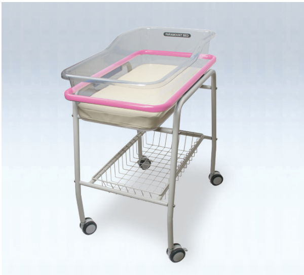
Photograph is PB-1100