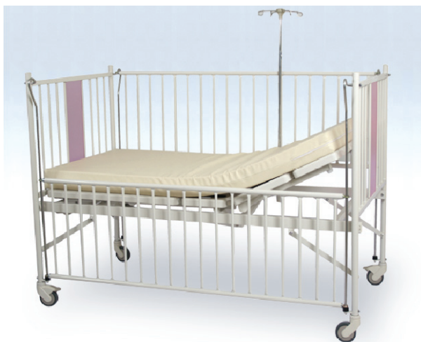
Photograph is PB-2100