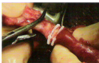
Hem-o-lok® XL clips used during a hysterectomy.

**Not intended for contraceptive tubal occlusion. Surgeon judgment should dictate clip selection for specific applications.